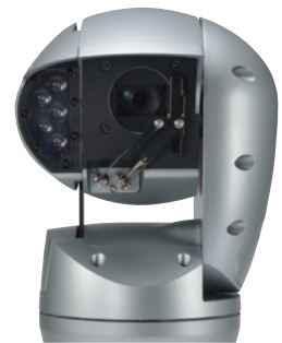
WV-SUD638 (Natural Silver) WV-SUD638-H (Gray) WV-SUD638-T (Brown)