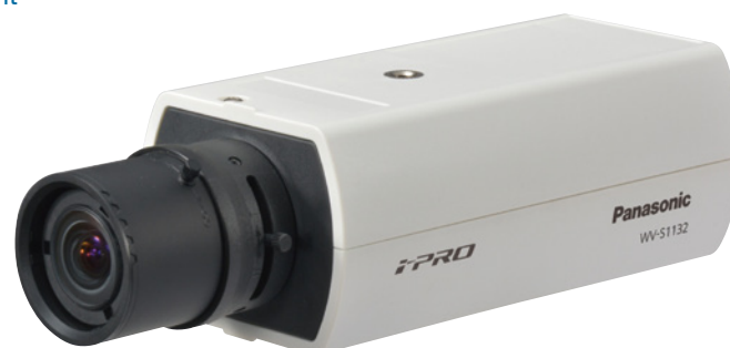
Lens : Optional